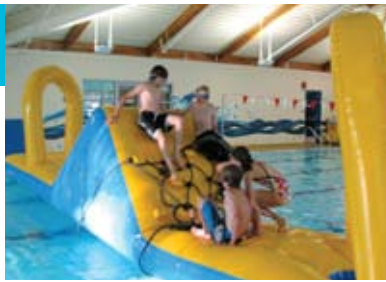
Big Floating Toy

The Sting Ray Swim Team started their season on May 2 and the new coaching staff did a great job with our