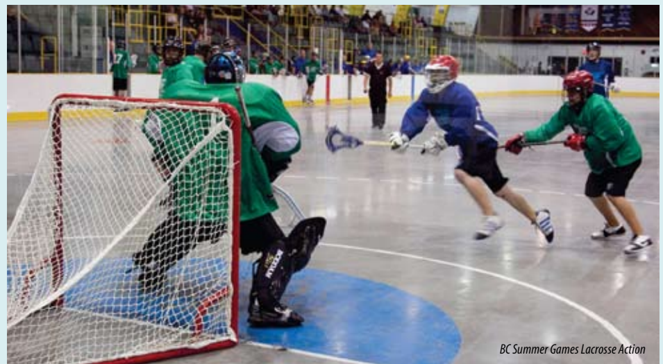
BC Summer Games Lacrosse Action