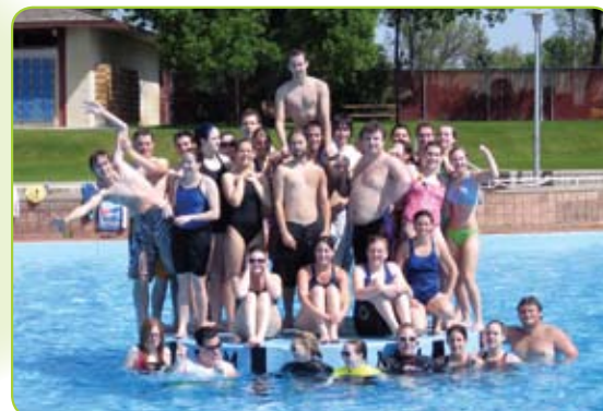
Henderson In-Service training