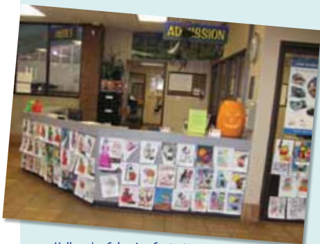
Hallowe'en Colouring Contest